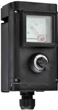
Polyamide Zone 1,2,21,22 Control Station