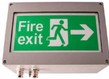
Zone 1,2,21,22 LED Exit