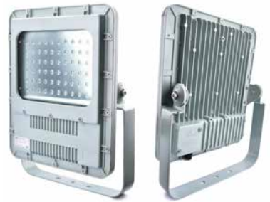
Zone 1,2,21,22 Led Floodlight and Streetlight