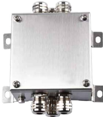
Stainless steel Zone 1,21 terminal enclosures