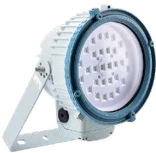
Zone 2 LED Floodlight