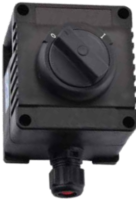
Polyamide Zone 1,2,21,22 Switch