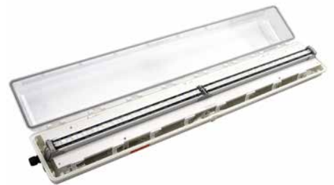
GRP Zone 1,2,21,22 LED Luminaire