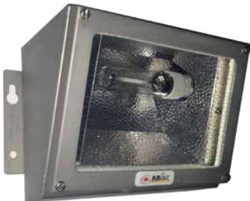
Zone 2,22 Stainless Steel Bulkhead