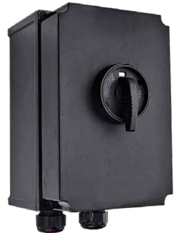
GRP Zone 1,2,21,22 Isolator