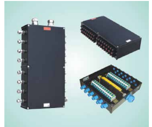
GRP Zone 1,2,21,22 terminal enclosures