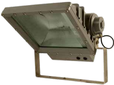
Zone 1 floodlight