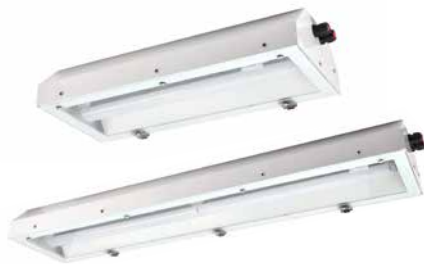
Powdercoated mild steel or stainless steel Zone 1,2,21,22 LED Luminaire