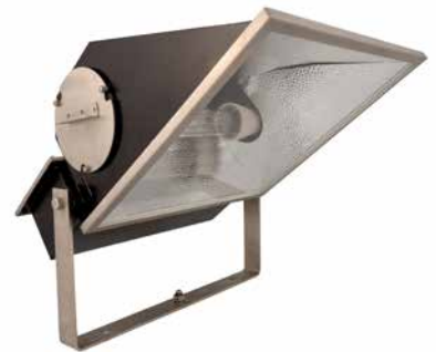
Zone 2,22 Stainless Steel Floodlight