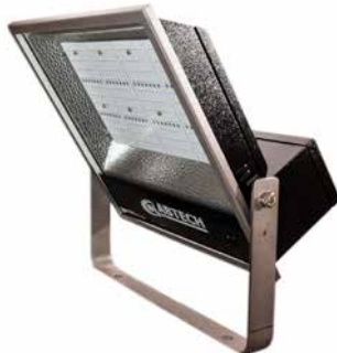
Stainless Steel LED Floodlight for Zone 1,2,21