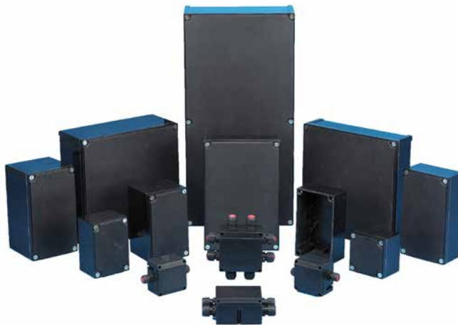
Polyamide Zone 1,21 Terminal enclosures