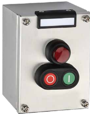
Stainless steel Zone 1,2,21,22 Pushbutton Station