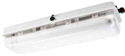
GRP Zone 1,2,21,22 LED Emergency