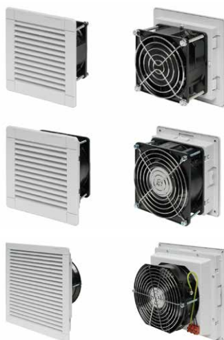
FILTER UNITS, FILTER FANS