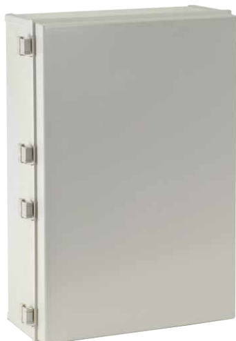
NON METALLIC ABS HINGED DOOR GREY