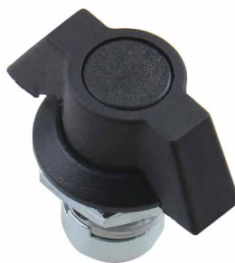
LOCKING SYSTEMS WING KNOBS