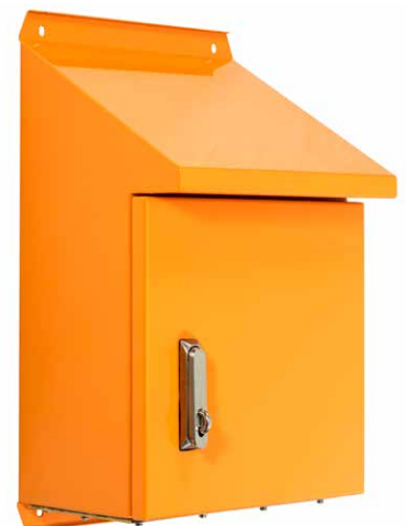
STAINLESS STEEL HEAVY DUTY SLOPED ROOF 5 Sizes Available