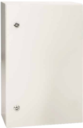
MILD STEEL WALL MOUNT