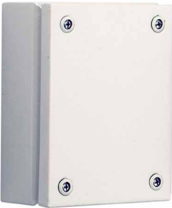
MILD STEEL TERMINAL BOX