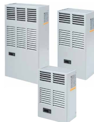
WALL MOUNTED AIR CONDITIONERS