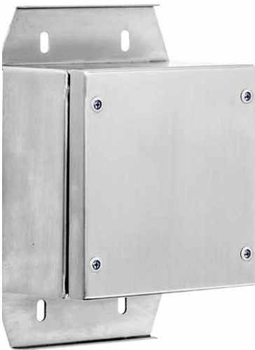
STAINLESS STEEL TERMINAL BOX 16 Sizes Available