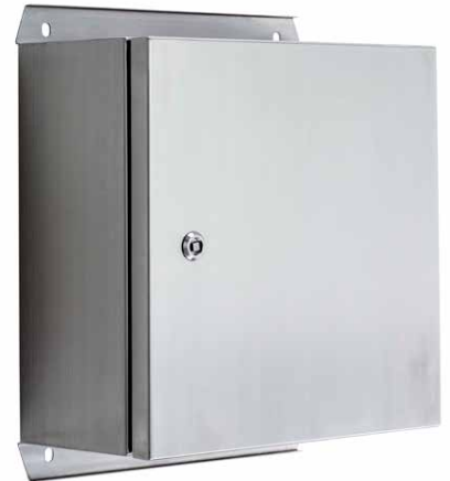
STAINLESS STEEL FLANGE MOUNT 6 Sizes Available