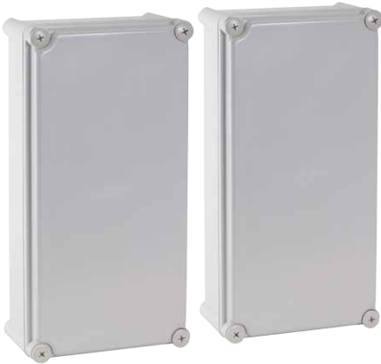
NON METALLIC ABS SCREW TYPE GREY