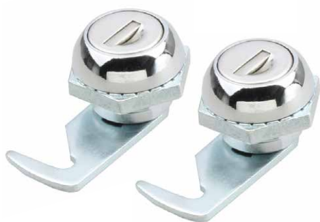
LOCKING SYSTEMS CYLINDER LOCKS