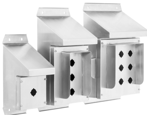
STAINLESS STEEL PUSH BUTTON SLOPED ROOF 7 Sizes Available