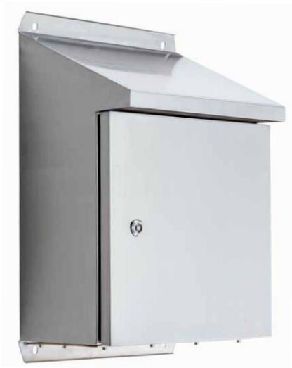
STAINLESS STEEL SLOPED ROOF BRASS GLANDPLATE