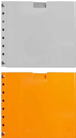
MILD STEEL ENCLOSURE ACCESSORIES Inner Door Kits, Plan Pockets, Earth Strap Kit, Door Stays, Wall Mounting Brackets, Louvre Plates, Canopies