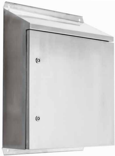
STAINLESS STEEL SLOPED ROOF 9 Sizes Available