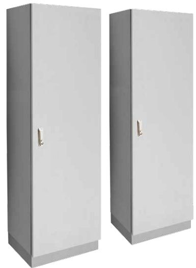
STAINLESS STEEL FLOOR STANDING 8 Sizes Available