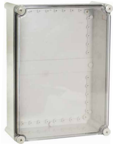
NON METALLIC ABS SCREW TYPE CLEAR