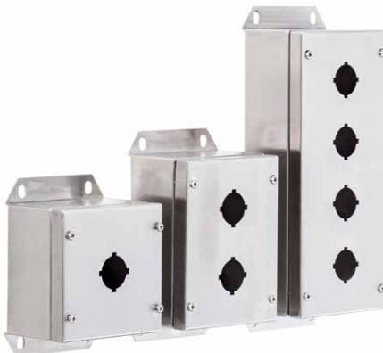
STAINLESS STEEL PUSH BUTTON STATION 8 Sizes Available