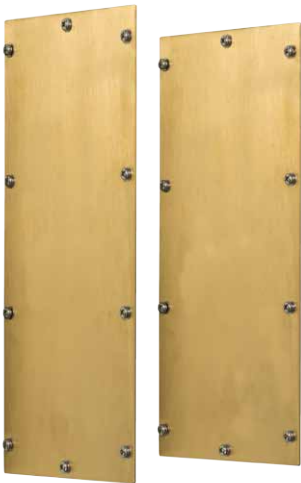
STAINLESS STEEL ENCLOSURE ACCESSORIES Brass Glandplates, Escutcheon Kits