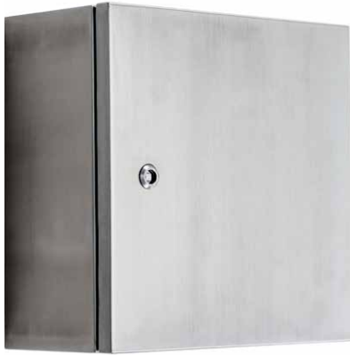
STAINLESS STEEL WALL MOUNT 19 Sizes Available