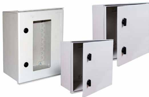
NON METALLIC POLYESTER GRP LATCH & HINGE TYPE