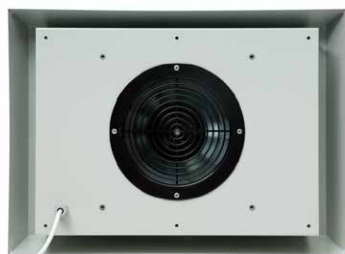
ROOF MOUNTED AIR CONDITIONERS