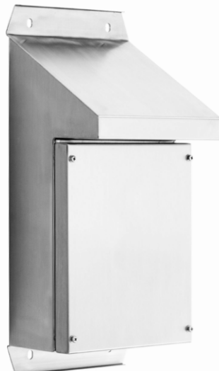
STAINLESS STEEL TERMINAL BOX SLOPED ROOF 4 Sizes Available