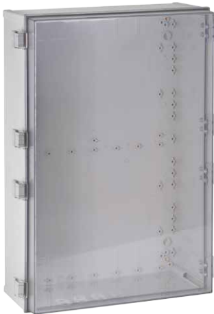
NON METALLIC ABS HINGED DOOR CLEAR