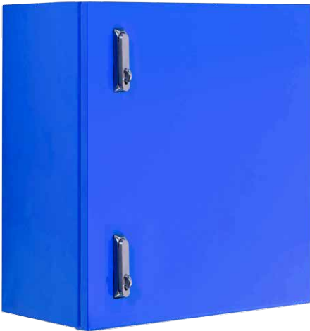
MILD STEEL 1000V